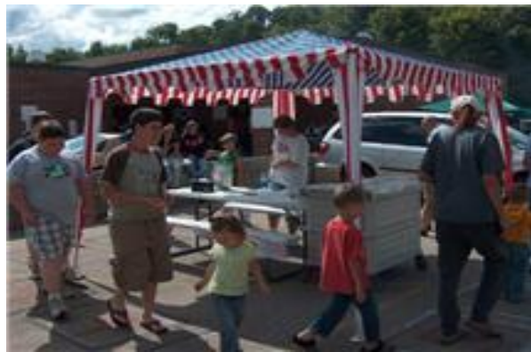
The ever popular cake walk will return for this year's Pullman Pride celebration

First planning meeting will be Monday, March 21st at 6:00 P.M. in the Township Hall.